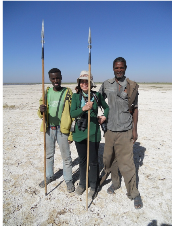
Meeting the locals at Abita Shala National Park

At least the strategy meant that I had enough room in my suitcase for 4½ kilograms of Ethiopian coffee to take home.